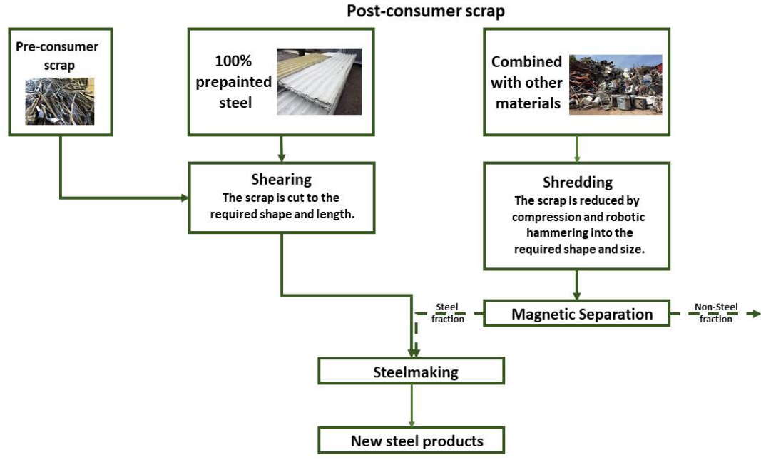
Figure 2. Recycling routes for prepainted steel

The largest end-use application for prepainted steel is the construction market. The prepainted steel is used as part of a "built-up" system involving mineral wool or supplied to the building site as a composite or "sandwich" panel containing a foam or mineral wool insulation layer.